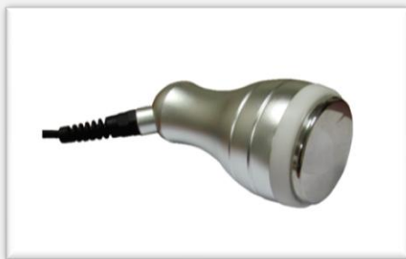
40K cavitations treatment probe