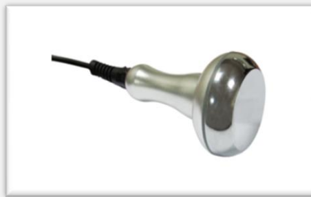
27K cavitations treatment probe