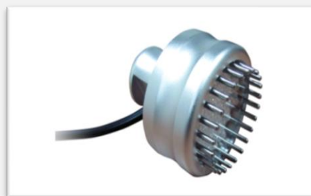
Electroporation and Phototherapy treatment Probe