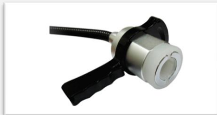
Vacuum & bipolar RF treatment probe